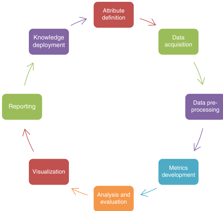
Fig. 2.3 The phases of the standard knowledge discovery process adapted to the context of game analytics